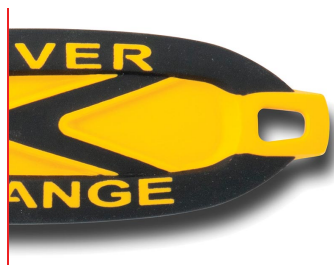
Innovative Plastic Tape Splitter Available in the yellow handle ONLY.