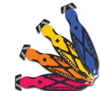
Available in Red, Orange, Yellow, and Blue.